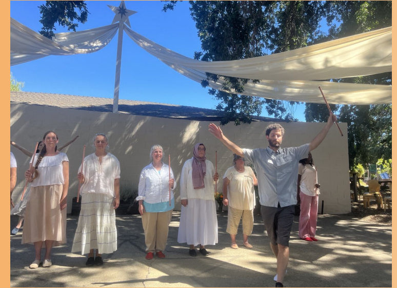
Eurythmy presentation, Class of 2025.

BACWTT is here to be a true regional center for Anthroposophical adult education in Northern California. We have grown actively for over 22 years and remain dedicated to genuinely meeting the needs of our region and the world through depth and authenticity. Our work is carried through the generous support of donors who recognize the value and importance of what we stand for; we could not carry out our mission without you. May I express a very deep gratitude from all of the students, alumni, faculty, program directors, board, and committee members for your support.