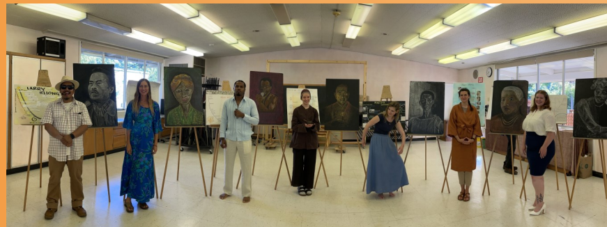
Biography project presentation, Class of 2024.